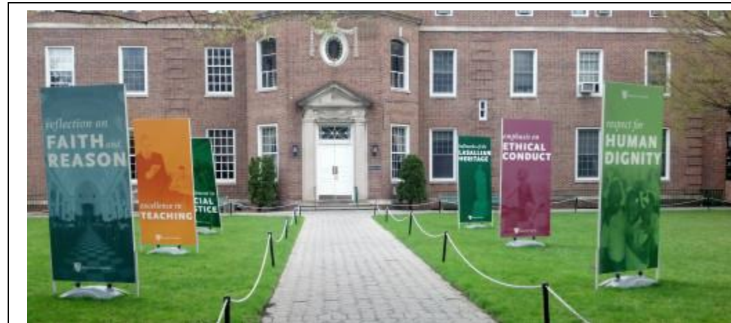
Signs displayed on the quad have different Lasallian values represented on each one.